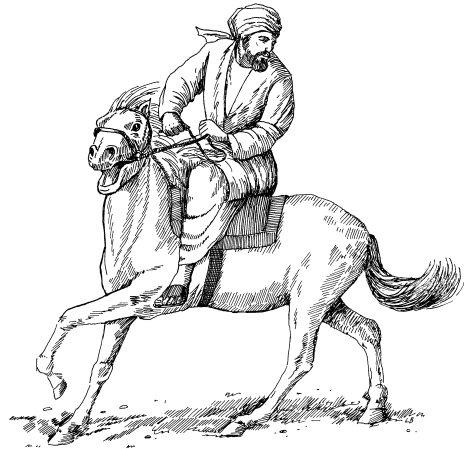
People use a little bit of iron in a horse's mouth to turn the horse

3 Think about the people that ride horses. They put a little bit of iron in the horse's mouth, and they tie ropes to it, then they use that bit of iron to turn the whole horse around, and they steer it wherever they want it to go. 4 And think