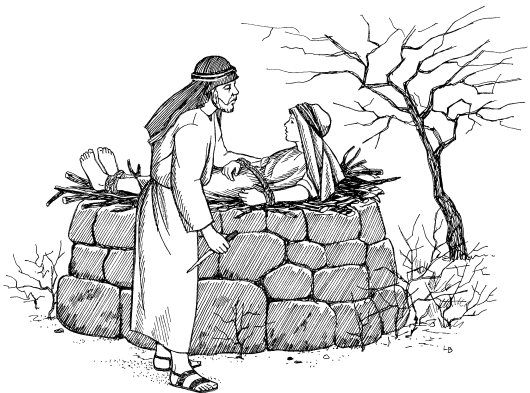
Abraham was going to kill his son to give him to God, but God told him to stop

To do that, Abraham had to kill Isaac, and burn his body on a table made of stones. Abraham believed that somehow God would make it end up all right, so he started to do that hard thing that God said. He was going to kill Isaac. But just